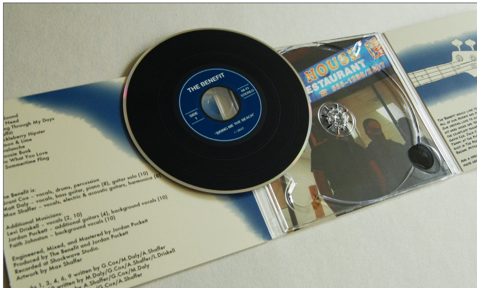
Interior and CD