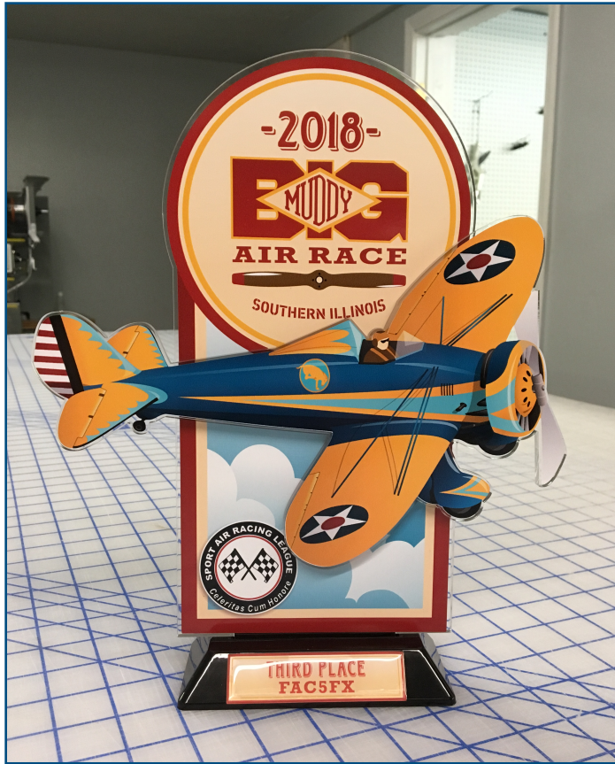
Photo of Fully-Constructed Trophy